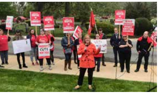
I joined nurses, paramedics, social workers and the Pennsylvania Association of Staff Nurses & Allied Professionals in front of Crozer Chester Medical Center to fight for essential health care services for Delco.