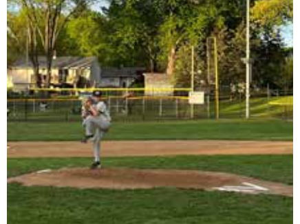
Aston Valley Baseball League was able to turn on the new field lights at Weir Park to play their first game under the lights. I worked with their Board for three years to make this project a reality.