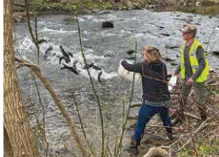
I got to join the Pennsylvania Fish and Boat Commission to stock trout in Chester Creek in Aston Township.