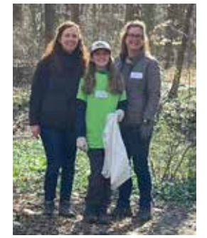
I joined CRC Watersheds for their stream cleanup at Crum Creek in Swarthmore.